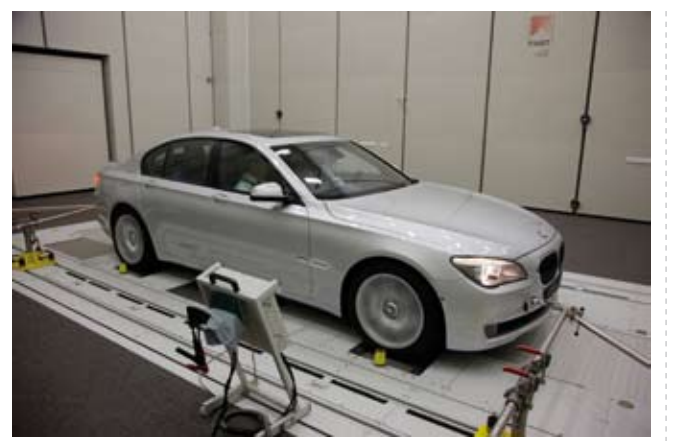
ABOVE: BMW acoustic test room with BCA cladding in Dingolfing, Germany

Depending on the calculated mode field of the